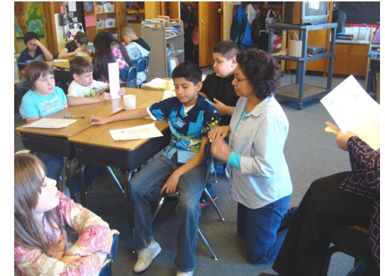
“In class our teacher reads to us and we have a chance to answer questions about the story.”